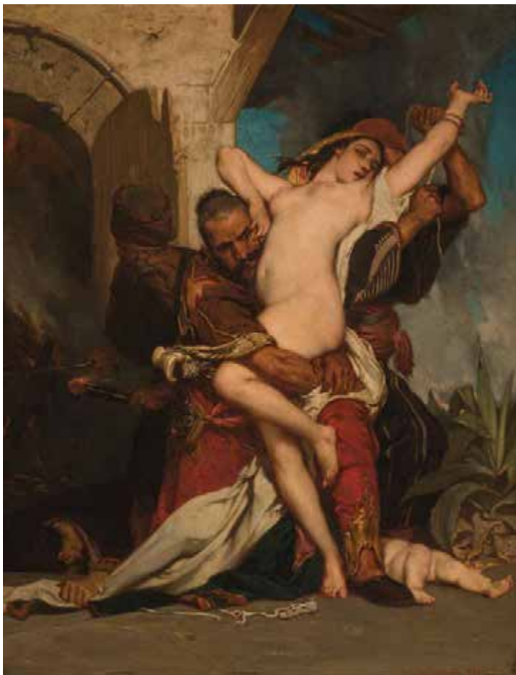
2.9 Jaroslav Čermák, The Abduction of a Herzegovinian Woman (1861), Dahesh Museum of Art, New York. 2000.19.

posed with Orientalizing erotic motifs such as the harem or the excessive brutality of the Ottoman overlords. 56