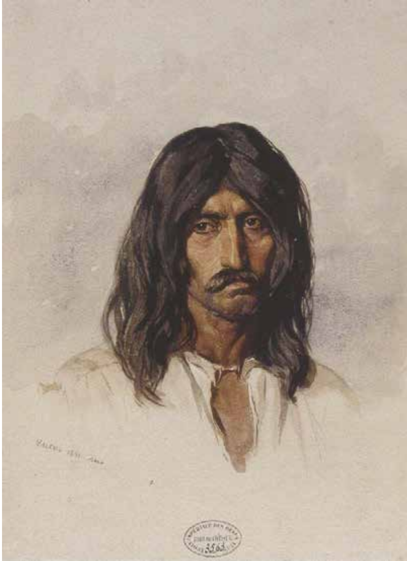
2.5 Théodore Valério, Roma from Arad-County (1851). Watercolour, École nationale supérieure des beaux-arts de Paris.