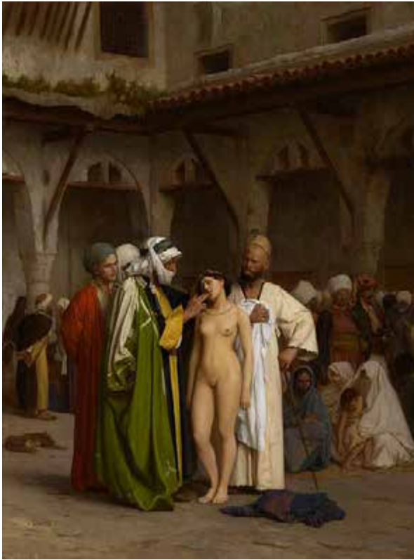
2.8 Jean-Léon Gérôme, Slave Market (1866), Williamstown, Mass., Sterling and Francine Clark Art Institute.

Conceived as a mixture between genre painting and historical representation, these depictions uniformly presented white women, exposed, staged for sale as sexual objects. Among the best-known representatives of this genre is William James Müller's (1812–1845) painting "Slave Market in Cairo", first exhibited in 1841, of which six copies were already known by 1875. Jean-Léon Gérôme's "Slave Market" had a particularly strong succession, and after its presentation at the Paris Salon in 1867, it subsequently became widely known via numerous replicas and print reproductions.