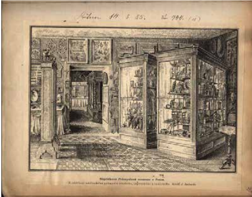
5.1 Interior of the Náprstek Museum – Chinese, Japanese and Indian collections. Engraving published in Světozor , August 14, 1885, clipping preserved in the Archive of the Náprstek Museum: fond Schrapbooks, No 133, Náprstkovo české průmyslové muzeum II, f. 52–54 (National Museum – Náprstek Museum, Prague, Czech Republic).

of the progress which supposedly liberated Europeans, and especially women, from the bondage of exhaustive physical labor and freed their minds for intellectual pursuits.