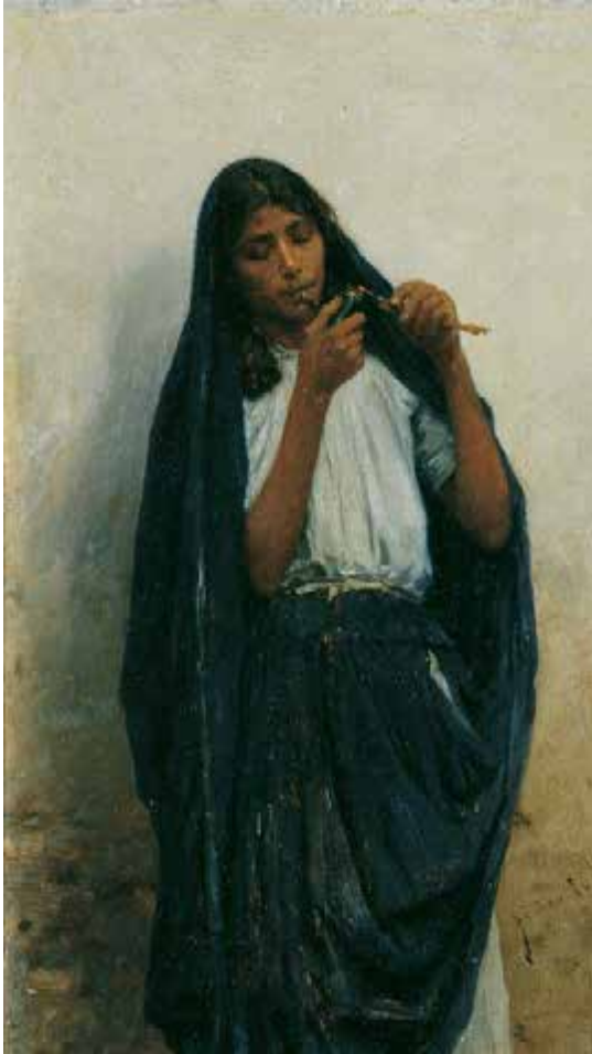
2.6 August von Pettenkofen, Smoking Roma Woman (1862), Vienna, Österreichische Galerie Belvedere.