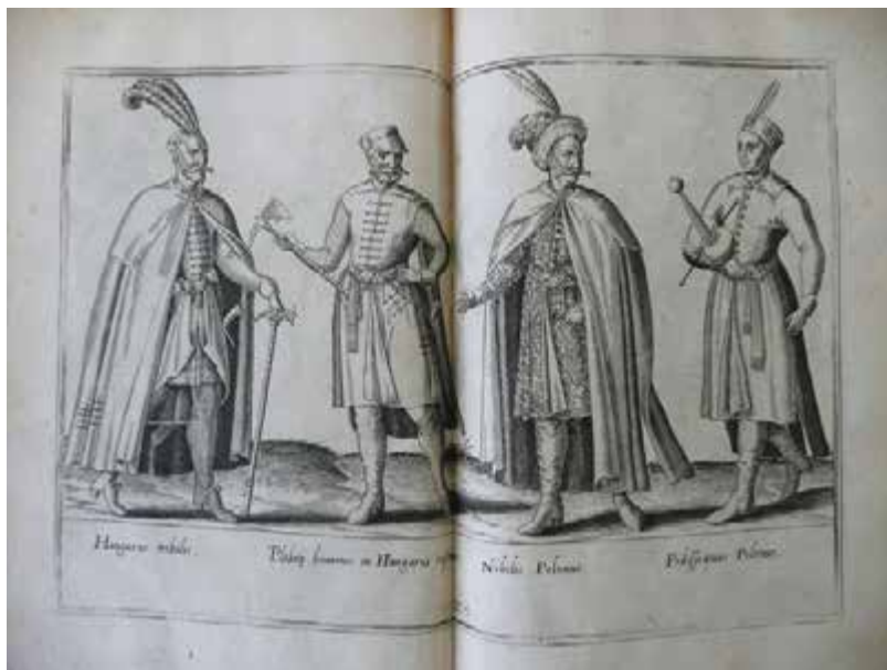
2.2 Hungarian and Polish Nobles, Illustration from Bryn, Abraham: Omnium pene Europae, Asiae, atque Americae Gentium Habitus, Coloniae (1577).

These hybrid cultural practices not only presented a challenge to the Western European travelers of the early modern period, but also to the categorizations that are used by us with regard to the phenomenon of Orientalism.