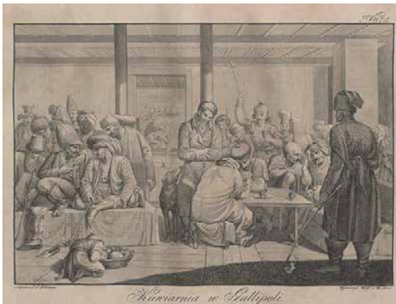
2.4 Ludwig Fuhrmann, Coffee House in Gallipoli . (Engraving), Plate 75 in Dziennik podróży do Turcji odbyty w roku MDCCCXIV (1821).

On closer inspection, the scene depicted by Fuhrmann appears less as an atmospheric account of the colorful hustle and bustle in the large room of an inn (Turk. Han) in Gallipoli (Turk. Gelibolu) than as a precisely composed image. In the center of the picture, the figure of a standing European dressed in white clearly distinguishes itself from the surroundings through its observing statics. The sitting and crouching characters around him are talking, playing cards and smoking tobacco or drinking coffee. The European in the center, probably Raczyński himself, appears as an observer who passes on supposedly value-free knowledge about what he has seen on his travels. In reality, it is a white man's privileged perspective on the exotic East. Such an interpretation is also supported by the framing figures, whose picturesque clothing is