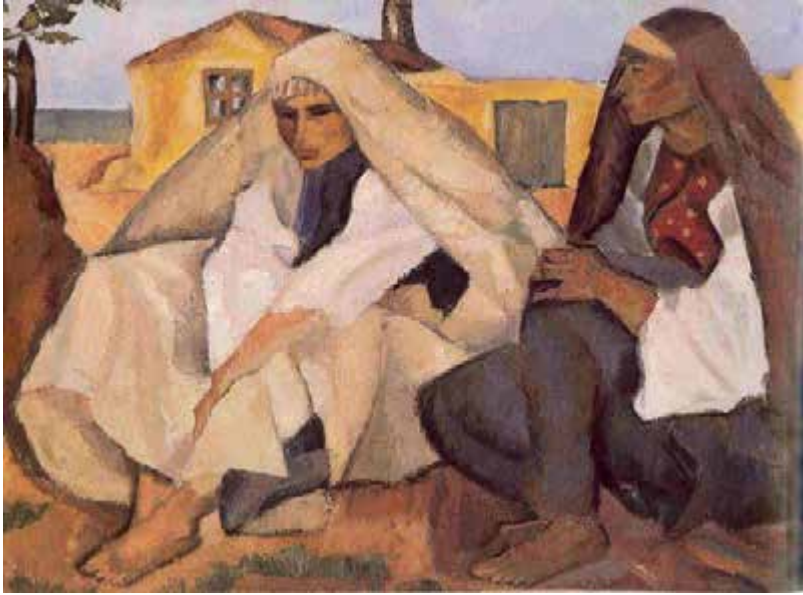
2.11 Josif Iser, Tatar Family (c. 1921). Bucharest, Muzeul Național de Artă al României.

The present study could only shed light on the variety of Orientalizing discourses with regard to, or from, East-Central Europe. Their specific manifestations were conditioned by the diversity of ethnic constellations in the region. Their arguments developed partly in parallel, but in some cases also came to contradictory results.