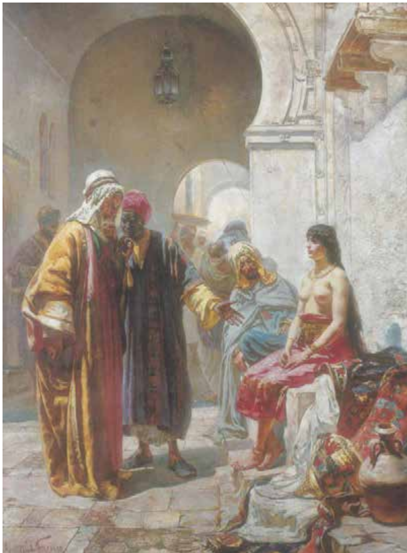
2.7 Ferenc Eisenhut, Arabian Slave Market (1888), Budapest, Magyar Nemzeti Galéria.