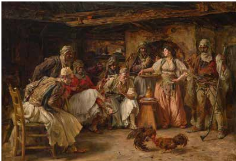
2.10 Paja Jovanović, Cockfight , Belgrade, Narodni Muzei.

In many of the paintings produced in large numbers after Bosnia's incorporation into the Dual Monarchy, violence plays no role, and neither does the idleness of the population, castigated in the caricatures in the press as backward. Bosnia had replaced Szolnok as the Orient on the threshold of the country. Comparable constellations are also encountered in Romania regarding the territory of Southern Dobruja, newly incorporated in 1913, a late and hitherto little-noticed offshoot of the Orientalism phenomenon in Europe. There, the Turkish and especially the Tatar population became popular exoticizing motifs in the works of several artists in the interwar period. 58