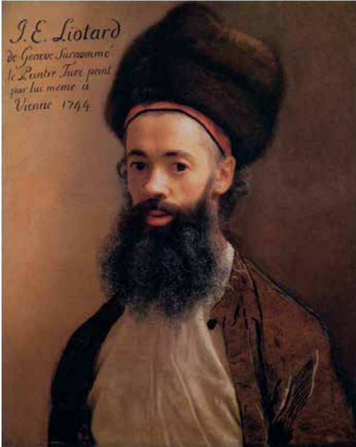
2.3 Jean-Étienne Liotard, Self Portrait as Peintre Turc (1744). Florence, Galleria degli Uffizi.

reign of prince Constantinos Mavrocordatos. In his famous self-portrait in Florence, Liotard describes himself as a “Turkish painter,” while in an analogous self-portrait he emphasizes that he appears with a Moldovan beard and hat. 27